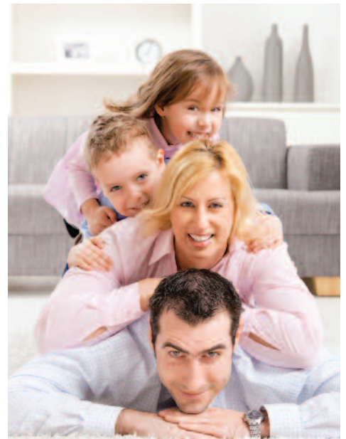
Insulation will bring you comfort and savings for the life of the home.

Adding insulation can offer you a lifetime of energy savings while improving the energy efficiency and comfort to your home.